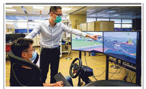
NTU • Team of roboticists wins two awards for autonomous driving technology | B5